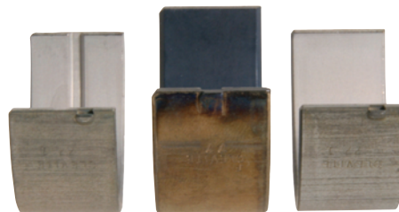
Shown is the the 1.850" NASCAR rod bearing, narrowed to less than .755" compared to the 2.100" SBC Chevy at .792" wides.