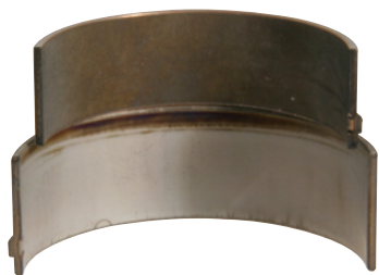
Notice the relative size from the 2" NASCAR main bearing to the 2.448" Chevy shaft size from the older days.