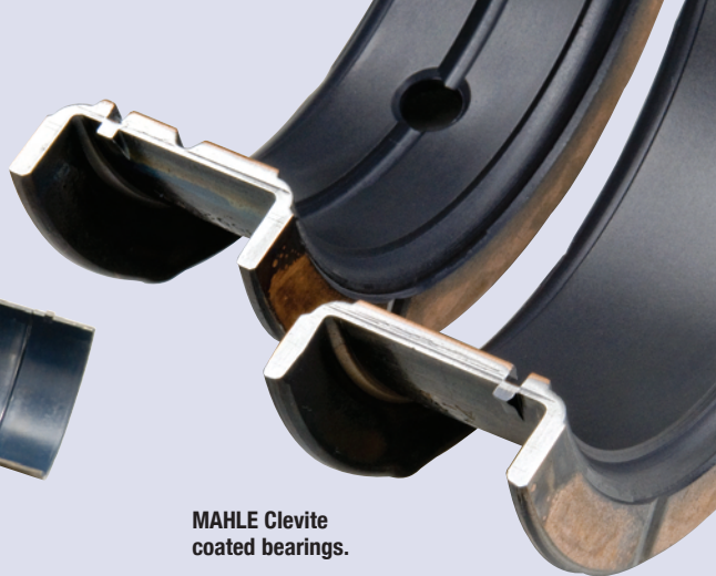
MAHLE Clevite coated bearings.

Here is a used set of rods after a race — when they look this good, there's power to be gained! Note: teams will use masking tape to keep the samples together making them easy to inspect and to show a customer.