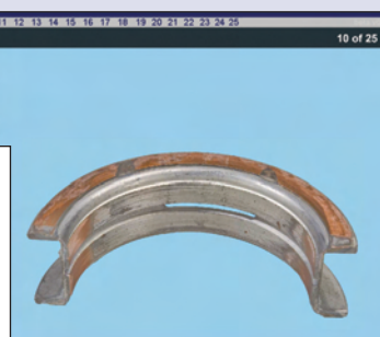
A screen shot of the MAHLE Clevite bearing eLearning course (left) and online bearing distress guide (above).

west coast builder of performance diesels. They've done much work with the GM Duramax® diesel and have documented examples producing in excess of 1300 HP on the dyno. This was a gradual process for them as are many performance engine projects...someone wondering what'd be possible. (Just a side note: NASCAR has found another 100 HP in the past 10 years, while still being limited to 355 CID) The stock parts worked pretty well at first, but they kept pushing the limits. First it was the limit of the stock piston, then it was the stock rod and next the stock engine bearings. We produced a racing rod and main set for them and it works very well, but I know if they keep increasing the power, we'll reach the limits of that set, too.